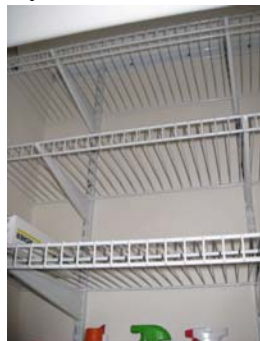
Shelving for laundry room (really a closet) came from Lowe's in America