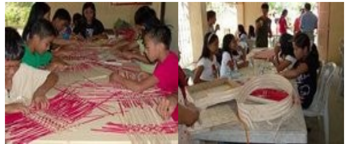
Hands-On Work at Bamboo Craft Training