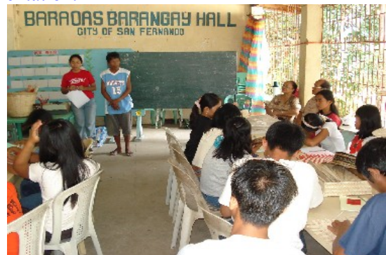
Training at Baraoas

As a continuing training program of Dakilang Pag-Ibig DIADEM, 8 Pastors and 2 church workers applied the skills they learned during a 6 month COMDEV course held weekly from July – December 2007 at the One Hope Ministry (OHM) in La Union. The team formulated a COMDEV program and implemented the first project in Barangay Baraoas, San Fernando on April 8 - 12, 2008. Community appraisal and coordination was done prior to implementation.