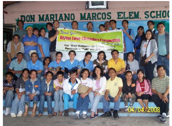
Project Tuli (Circumcision Team) Baguio City